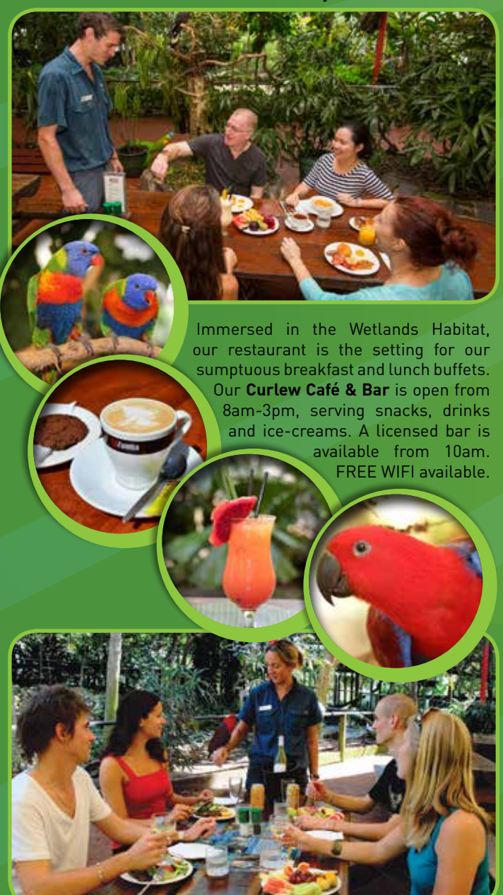
Lunch with the Lovikeets 12pm - 2pm daily